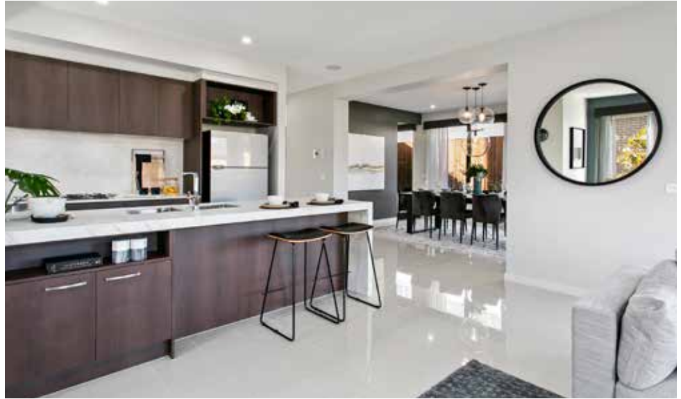
Photo is for illustrative purposes only and does not depict the home for sale. This image contains internal or external luxury upgrade items and furniture not included in the home price.